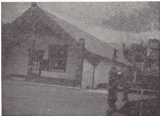
A NATIVE CHURCH IN NEW ZEALAND

A Report by the Editor on the Native Polynesian Sabbath-Keeping Churches of New Zealand.